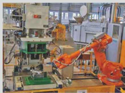
Completely integrated cells with robotic extraction, auto-sprayers, dosing furnaces, and integrated trimming presses.