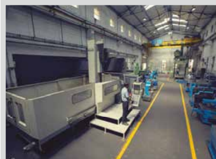
Die manufacturing and assembly