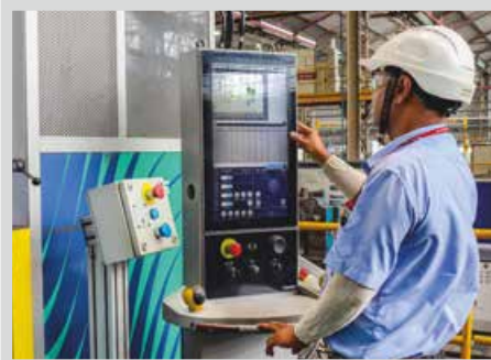
Real time process controls on HPDC machines