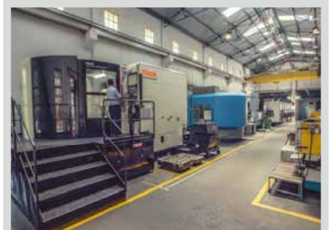
5-axis High speed CNC milling machines