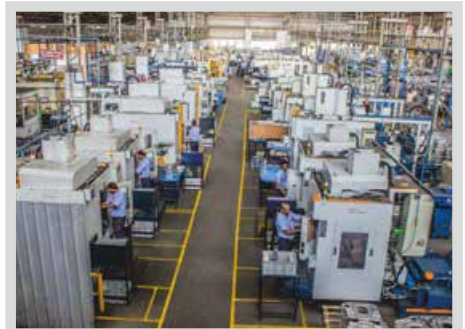
Dedicated machining cells for high volume parts