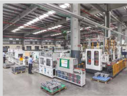
Machining Cell 2