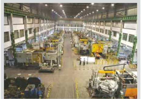
Comprehensive range of HPDC equipment ranging from 160T to 3200T locking force