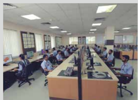
Hi tech design / engineering center