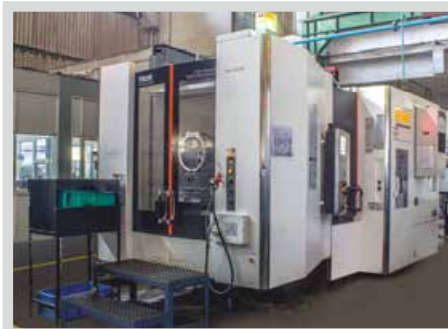
State-of-the-art machining centers