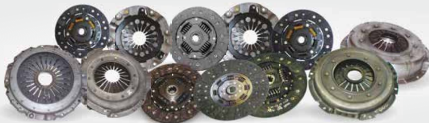
Full range of clutches from 160mm dia to 430mm dia